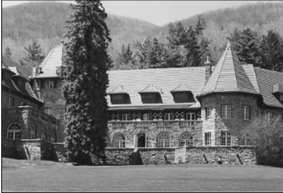
Southern Vermont College is located in Bennington, Vermont.

S outhern Vermont College (SVC) began as Saint Joseph College, a business school established by the Sisters of Saint Joseph in 1926. In 1974, the College, which no longer has a religious affiliation, was renamed and moved to its present location on the 371-acre Everett Estate.