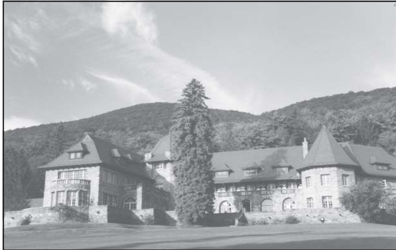
The Everett Mansion at Southern Vermont College in Bennington, Vermont.

Southern Vermont College is a private, student-focused, career-oriented, liberal arts college located in the southwest corner of the state. The student-faculty ratio of 11:1 enables students to express their ideas, give feedback, and grow intellectually and socially within a supportive environment. The exchange of thoughts and information continues where classes end, taking place everywhere that students, faculty, and staff come together. Southern Vermont College students participate in the numerous extracurricular events offered on campus and in the Bennington community. They can be seen volunteering with the Alpha Phi Omega National Service Fraternity, racing down the slopes with the Ski-Snowboarding Club, and protecting the Vermont environment through the Everyone's Earth environmental club.